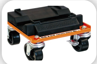
Plow Dolly $69.99 EA (set of 3)