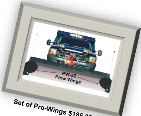
Set of Pro-Wings $185.08 EA

**FREIGHT CHARGES MAY APPLY TO NON-STOCK ITEMS**