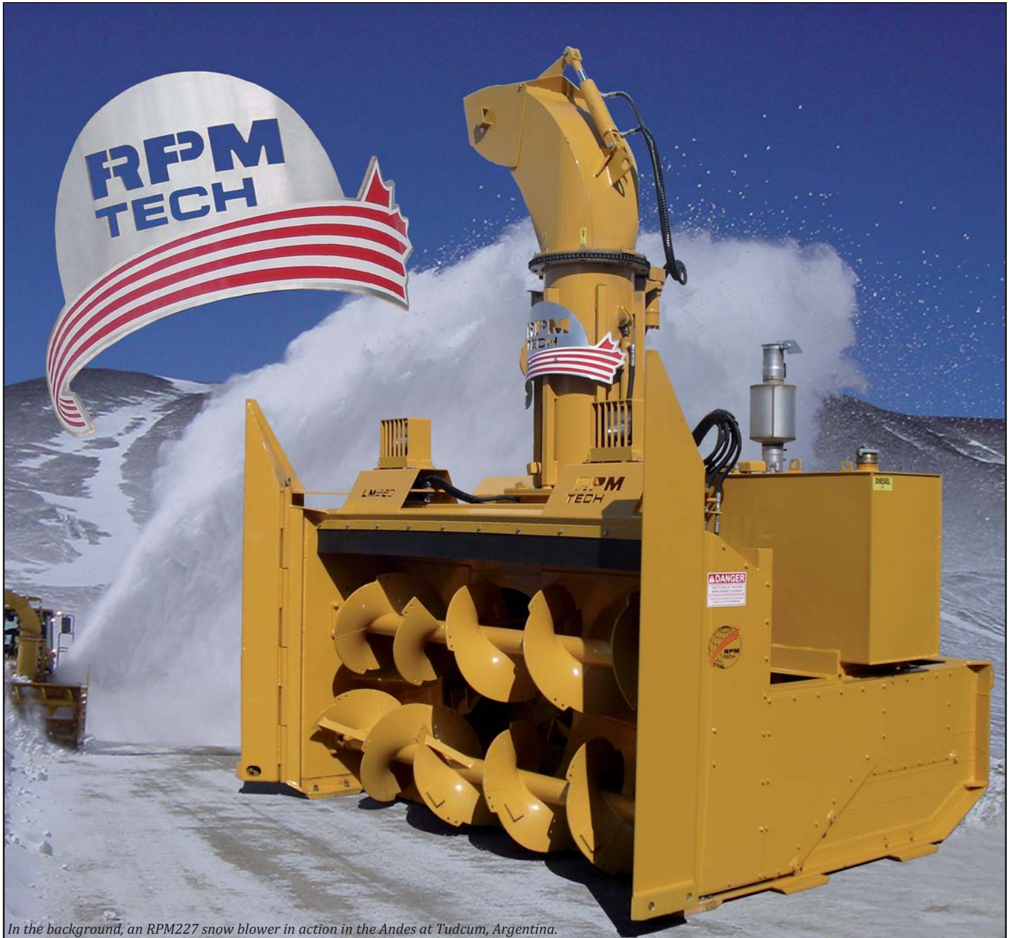
In the background, an RPM227 snow blower in action in the Andes at Tudcum, Argentina.