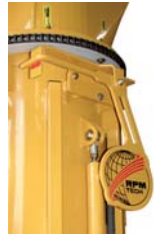
The pendulum installed on the chute indicates whether the snow blower is level.