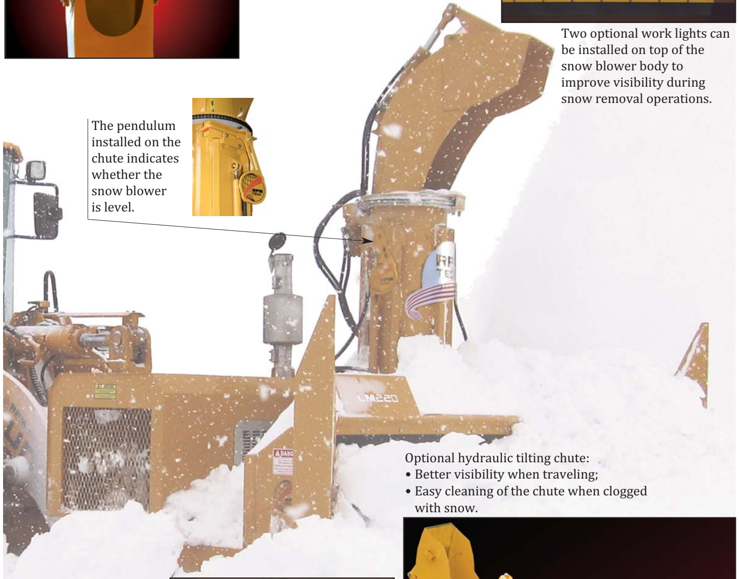
Optional hydraulic tilting chute: • Better visibility when traveling; • Easy cleaning of the chute when clogged with snow.