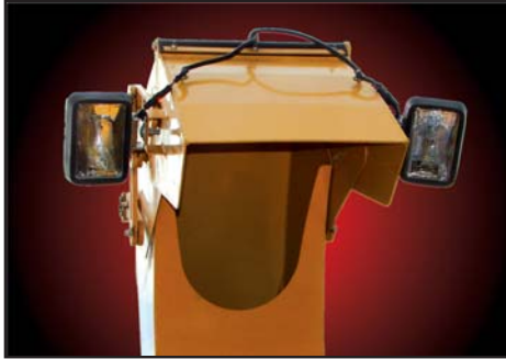
Two optional work lights installed at the end of the chute improve visibility when loading the snow in a truck.