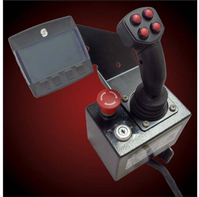
HIGH RESOLUTION GRAYSCALE LCD DISPLAY AND PLUS +1 JOYSTICK FROM SAUER DANFOSS