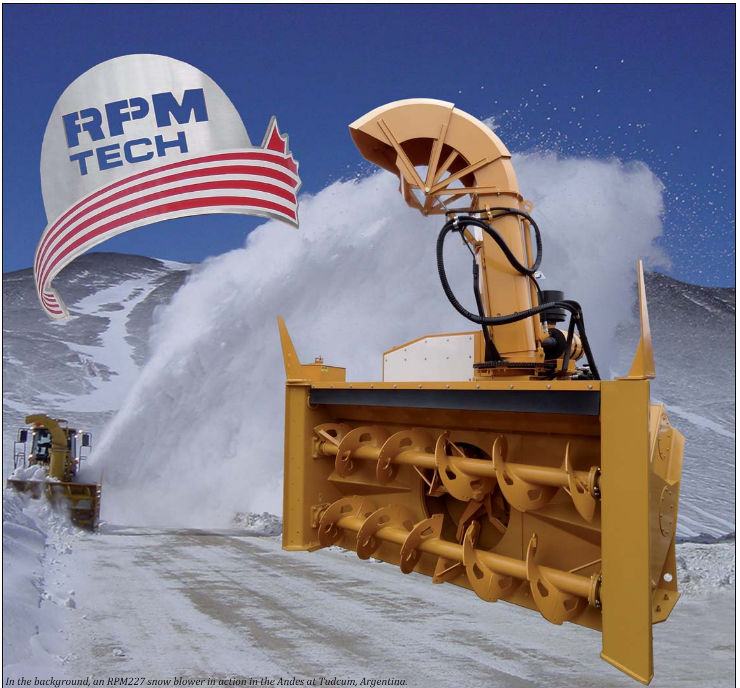
In the background, an RPM227 snow blower in action in the Andes at Tudcum, Argentina.